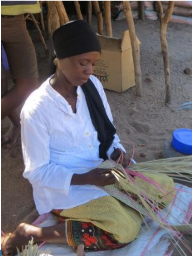
Left: basket making Right: the village mill